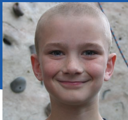
Gary wished to meet the crew of The Deadliest Catch .